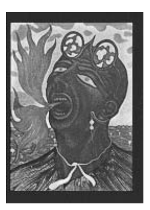
These paintings are two selections from the Graphic Cycle on the Universal Declaration of Human Rights by the Austrian painter Arik Brauer. The painting on the left refers to Article 13 of the Declaration ("Freedom of movement"), the one on the right to Article 19 ("Freedom of speech"). The exhibit has been touring Canada and will be at the University of Alberta until November 30, 1998.

droits qui appartiennent à tout être humain parce qu'il ou elle est un être humain; des droits dont chacune et chacun a besoin pour pouvoir mener une vie digne d'un être humain, une vie dans la dignité. L'idée de dignité humaine, de l'égale dignité de tous les êtres humains, est le fondement de tout l'édifice des droits de l'homme.